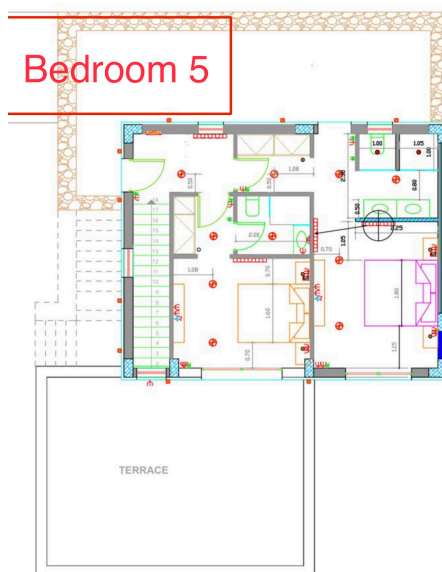
Electrika Ydravlika A/C Villa 5 A first floor