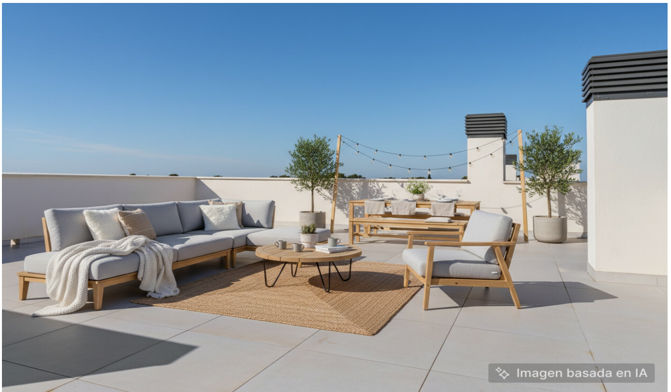
Imagen basada en IA

PURCHASE PRICE: 768.000 EUR • LIVING SPACE: ca. 94,06 m 2 • ROOMS: 3