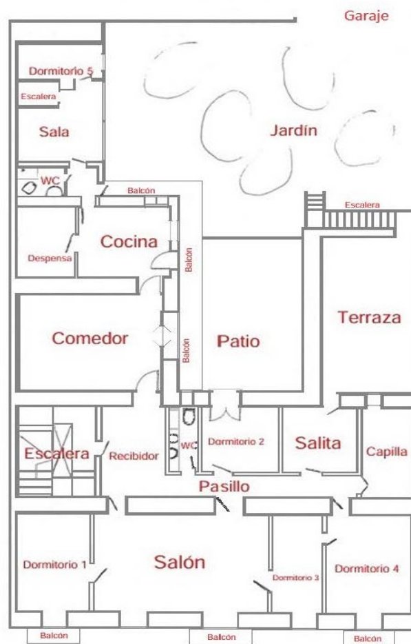
Binissalem 1º Piso