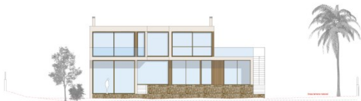
A lizado suroeste