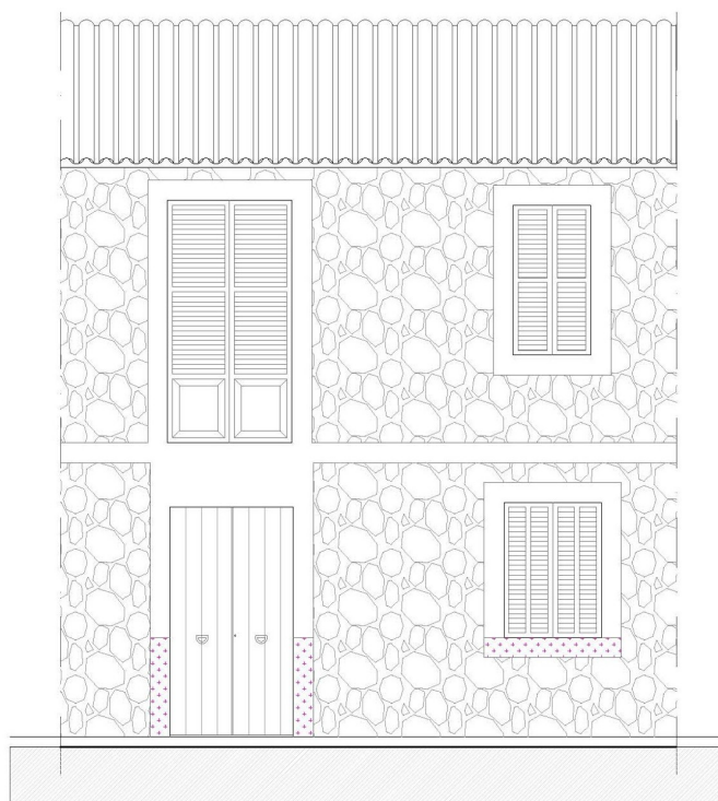
ESTADO REFORMADO - FACHADA PRINCIPAL