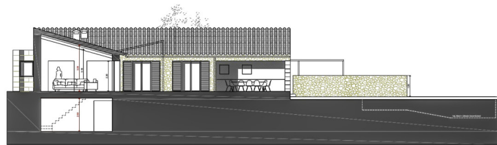
SECTION 0 E 1/00