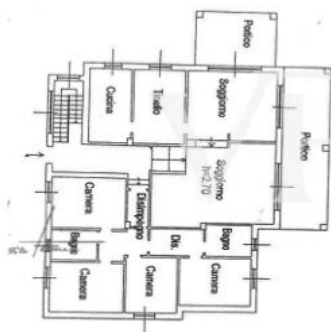
PIANTA PIANO TERRA