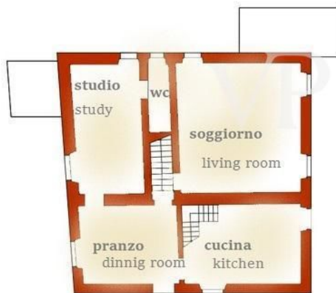
PIANTA PIANO TERRA