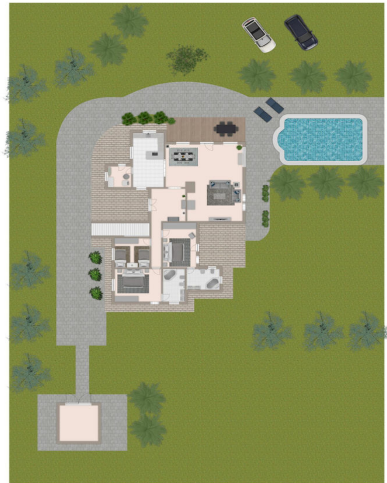
Exposéplan, nicht maßstäblich

This floor plan is not to scale. The documents were given to us by the client. For this reason, we cannot guarantee the accuracy of the information.