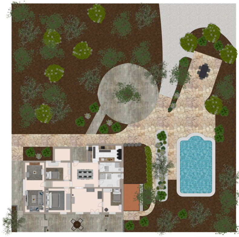
Exposéplan, nicht maßstäblich

This floor plan is not to scale. The documents were given to us by the client. For this reason, we cannot guarantee the accuracy of the information.