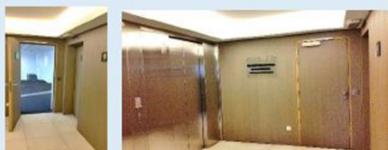
Level +4 Entrance