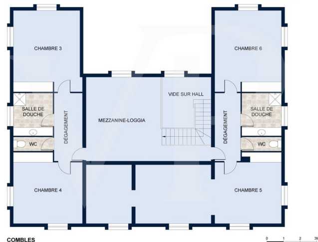
COMBLES 0 1 2 3M Les plans sont fournis à titre d'information et ne sont pas contractuels

This floor plan is not to scale. The documents were given to us by the client. For this reason, we cannot guarantee the accuracy of the information.