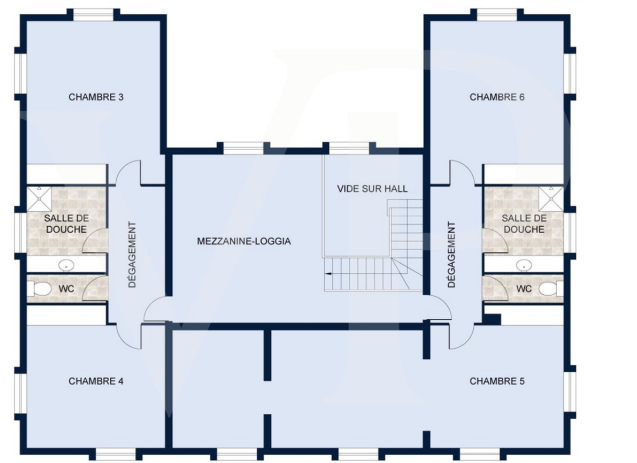
COMBLES 0 1 2 3M Les plans sont fournis à titre d'information et ne sont pas contractuels

This floor plan is not to scale. The documents were given to us by the client. For this reason, we cannot guarantee the accuracy of the information.