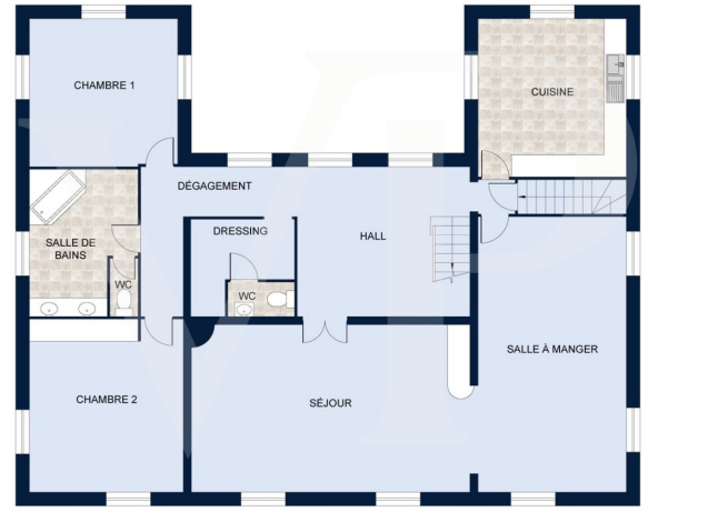
REZ-DE-CHAUSSEE 0 1 2 3M Les plans sont fournis à titre d'information et ne sont pas contractuels