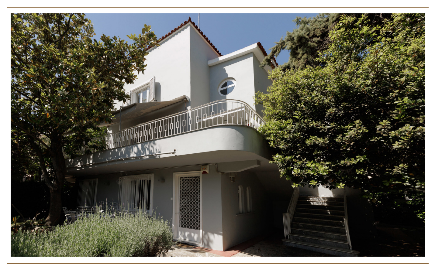
KAUFPREIS: 4.500 EUR • GRUNDSTÜCK: 600 m<sup>2</sup>