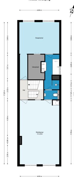
Maarten Jansz Kosterstraat 17 - Amsterdam Tweede verdieping

De plattegronden zijn geprojecteerd voor promotionele doeleinden en ter indicatie. Aan de plattegronden kunnen geen rechten worden ontleend.